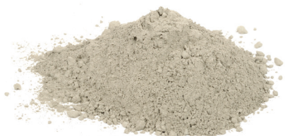
Figure 1. portland cement

The product under evaluation is portland cement as defined by ASTM C219 and specified in ASTM C150, ASTM C1157, AASHTO M 85 or CSA A3001.