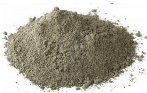
Figure 1: Visual Representation of Typical Cement

Figure 1 below shows a visual representation of typical finished cement product.