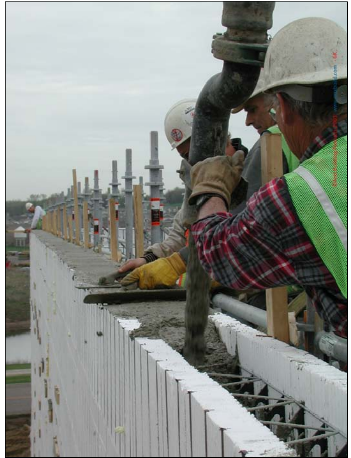
Figure 4. High performance concrete building systems such as insulating concrete forms, tilt-up concrete and concrete frame construction help a building meet the requirements of LEED 2009 NC energy performance requirements.

The intent of this credit is to further increase water efficiency within buildings to reduce the burden on municipal water supply and wastewater systems. Employ strategies that in aggregate use less water than a typical building. Strategies include using alternate on-site sources of water, such as rainwater and stormwater. Pervious concrete systems in combination with concrete cisterns can be used to fulfill the requirements for this