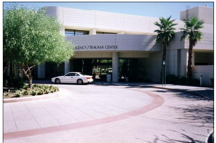
Figure 3. Concrete pavement can be used to reduce urban heat islands (Sustainable Sites Credit 7.1)

Another strategy to achieve this credit is to place a minimum of 50% of parking spaces under cover, including underground,