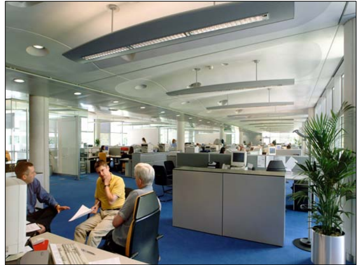
Figure 5. Concrete floor systems can span large distances with shallow floor plates helping improve daylight and views (Indoor Environmental Quality Credit 8.1 and 8.2)

Another potential innovation is to use exposed concrete for walls, floors and ceilings. This strategy would eliminate a significant quantity of wall and floor coverings along with ceiling materials, all of which are common sources of volatile organic