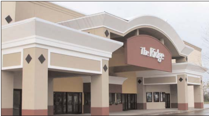
ICFs “deaden” sound: ICF’s concrete and foam are ideally suited for movie theatres.